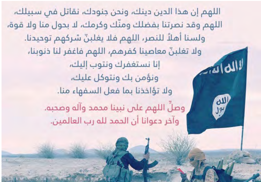
Telegram (accessed December 2, 2015)

O, God! This religion is Your religion, and we are Your warriors. We fight in Your path. O God! Our victory depends upon Your grace, favour and kindness. Their polytheism will not defeat our monotheism. Our disobedience will not vanquish their unbelief. O, God! Forgive us our sins. We seek Your forgiveness and turn to You in repentance. We believe in You and trust in You. Do not blame us for what the shameless are making of us. Bless, O God, our Prophet Muhammad, his family and his companions. Our final prayer is that all praise may be for God alone, Lord of all the worlds.