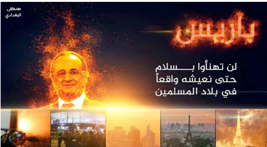
Telegram (accessed November 14, 2015)

“You will not enjoy peace unless and until we ourselves truly live in peace, in the lands of Muslims.”