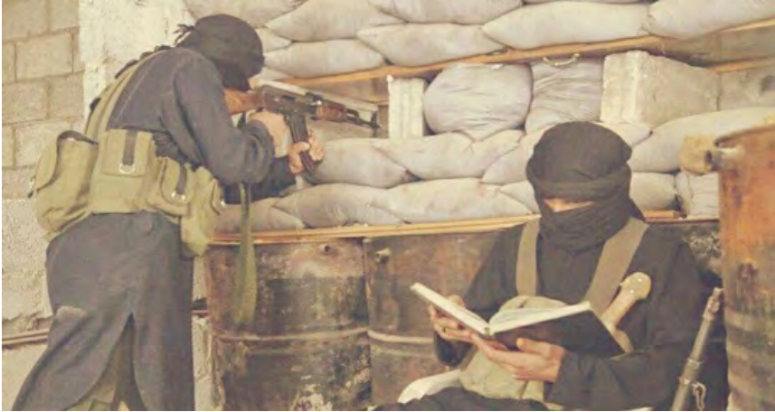
Telegram (accessed November 29, 2015)

We may cite many examples in which conflict has been recoded in religious language and symbols (Kippenberg 2010), without saying which came first: religion or conflict. In the present case, we may assume that the practical logic of jihadi actors allows for just one code: religious violence.