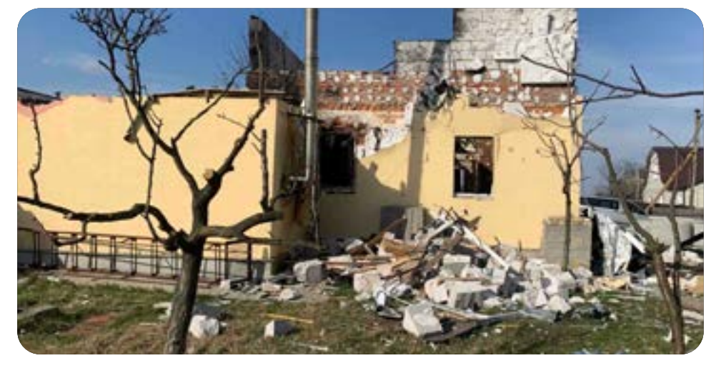
The war has caused significant and widespread damage to homes and infrastructure

With the winter months approaching and battle fronts expanding the situation remains far from stable and there is still potential for a new wave of refugees.