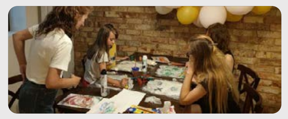
Children activities in KDM temporary shelter

Church for the City in Poland provides long term refuge