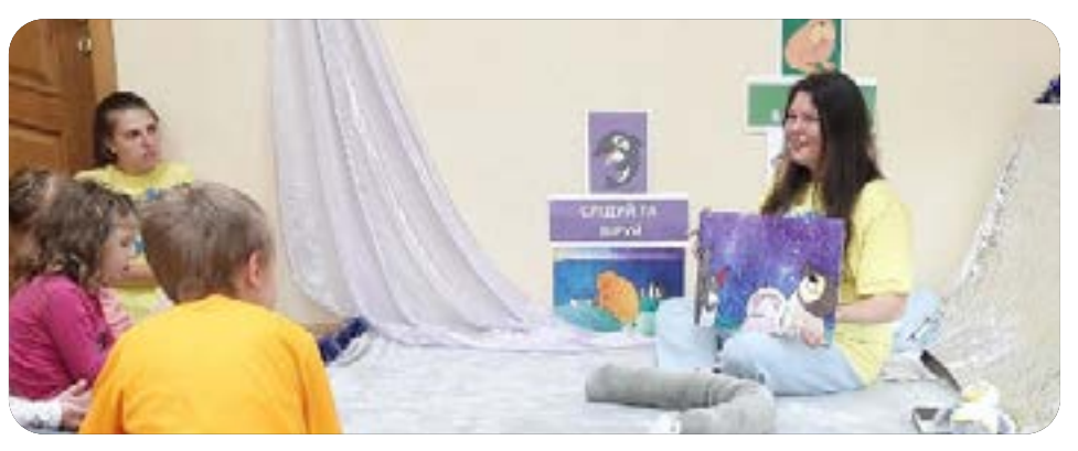
Therapeutic storytelling for children.

Children's Mission has reported that 20% of children who go through these camps discover that they have a deeper trauma and are assisted by their mentors in understanding it. Among these children, 2-5% require professional psychological assistance and are directed to local professionals. In two months of OpSafe operating in Ukraine, their teams, trained and supervised by Children's Mission, have held 31 camps and reached 1,700 children. Additional camps are also being planned. OpSafe, Children's Mission, and their teams plan to continue their efforts and reach as many children as possible.